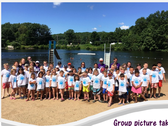
Group picture taken 6/28

WEDNESDAY: WOODTICK REC AREA; wear swimsuit and sunscreen to camp; flip-flops or sandals are permitted for the day; departure is at 9:30; weather permitting.